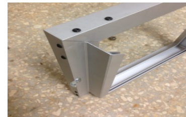
Aluminum frame to lock in filters and hold cover or manifold