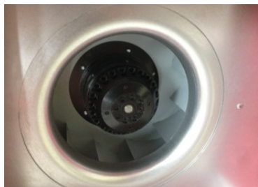
Sealed bearing, direct drive, quiet 2.8 amp motor with Impeller fan