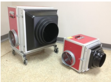
Manifolds for A600 and A1200