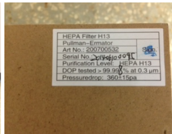
99.99 + 0.3 Micron INDIVIDUALLY tested and certified HEPA