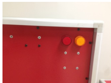
Warning lights for air restriction and air bypass