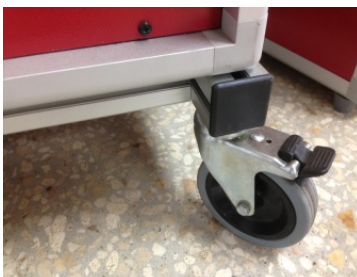
Locking non-marking wheels on A1200