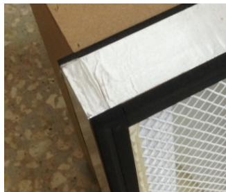
Memory foam on HEPA and rubber on frame for seal