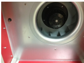
Easy to clean interior, fully Silicon for strength and seal