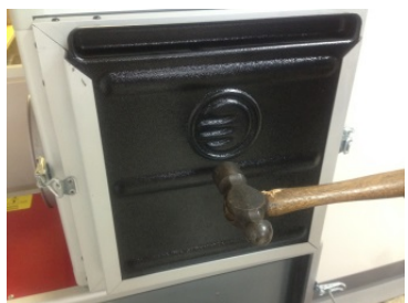
Protective cover for HEPA Protection when transporting