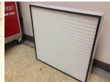
Wire protection for the 2000 hour rated HEPA filters