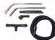
Tool Kit B160450