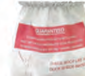
"Never Clog" Filter Bag B000517