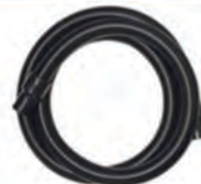
10' X 1.5" crushproof hose B000311