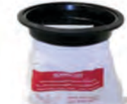
HEPA Filter Assembly B160009