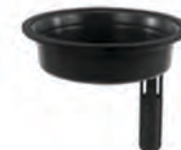
Wet Pickup Adaptor B000379