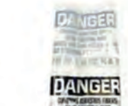
Disposable Poly Bags B524263