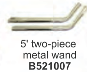
5' two-piece metal wand B521007