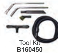
Tool Kit B160450