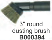
3" round dusting brush B000394