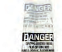
Disposable Poly Bags B524263