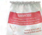
"Never Clog®" Filter Bag B000517