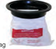
HEPA Filter Assembly B160009