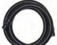
10' X 1.5" crushproof hose B000311