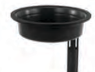
Wet Pickup Adaptor B000379