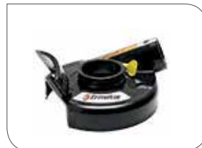
7" Dust Shroud