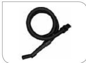
Hose assembly, 1.25" x 6"