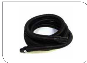
2" Hose Assembly