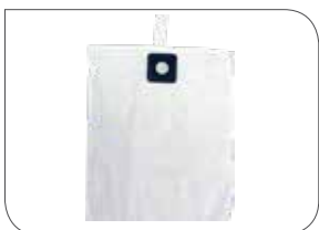
Bag, high filtration