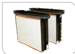
HEPA filter, 2/set