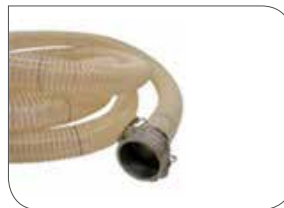
3" Hose Assembly