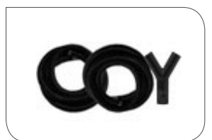
Hose kit, standard twin