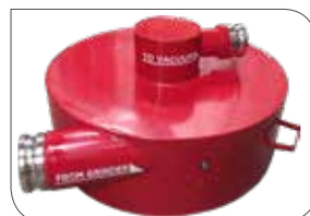
Deluxe drum pre-separator assembly