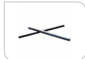
Blade Set 18"