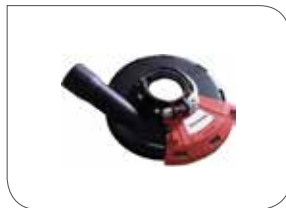
5" Dust Shroud Kit