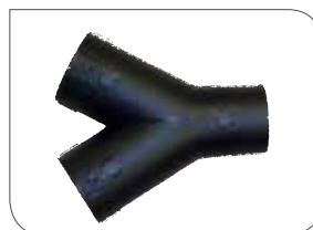
Y connection set. 1.4"-2x1.4"