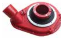
Deluxe 7" dust shroud