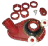
Deluxe 5" dust shroud