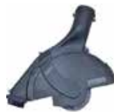
Dust hood for 7"-9" grinders