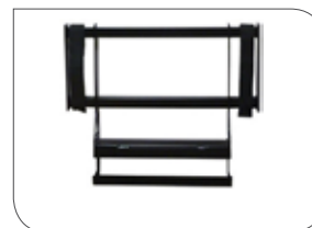
Trailer, Large Vac (T 8600 & T 7500)