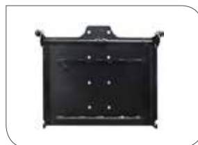
Trailer, Large Vac (T10000)