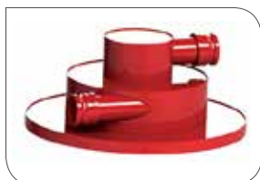
Drum pre-separator assembly