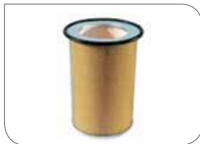
HEPA Filter T-Line