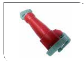
Plug-to-power, 60 AMP