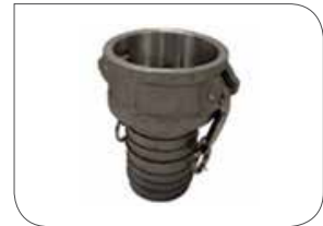
Camlock 3" Aluminum