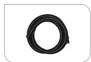
Hose 10 x 1.5 crush proof