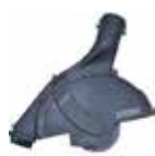
Dust hood for 4"-5" grinders