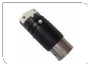
Plug-to-grinder, 50 AMP