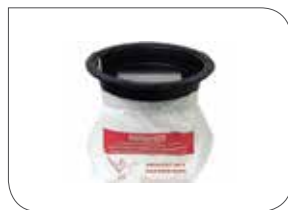
HEPA filter 16"