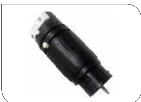
Plug-to-power, 50 AMP