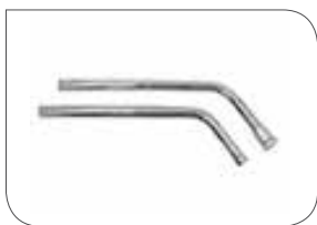
Metal wand, 5" two-piece