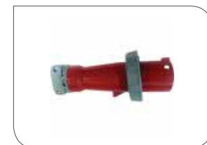
Plug-to-grinder, 60 AMP