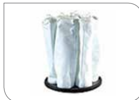
Filter Stock Assembly