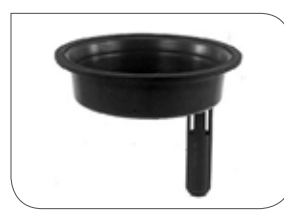
Wet pick up adaptor