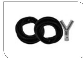
Hose kit, deluxe twin