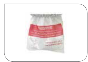
Dacron "never clog" filter bag