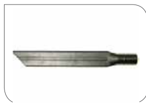
Crevice tool 17"