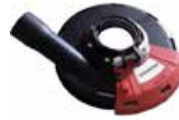
Standard 5" dust shroud