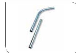
Wand Tool, 2-part