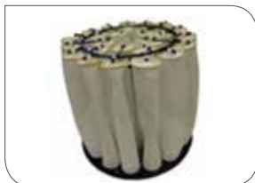
Main Filter Stock